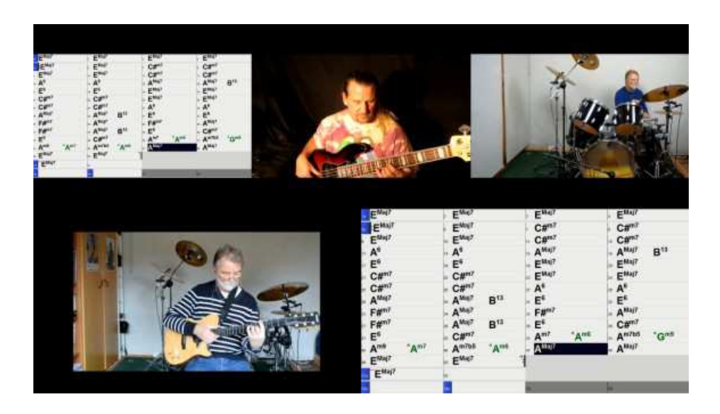
With key Esc, the lower shown state of the player appears

When key P pressed, the player starts playing in full screen.